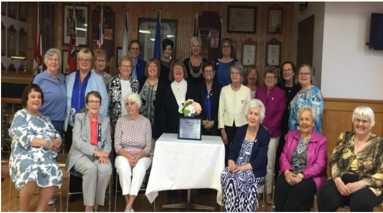
45 th YEAR anniversary supper, St. Joseph's CWL council, North Sydney