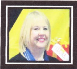
Antigonish Diocesan President